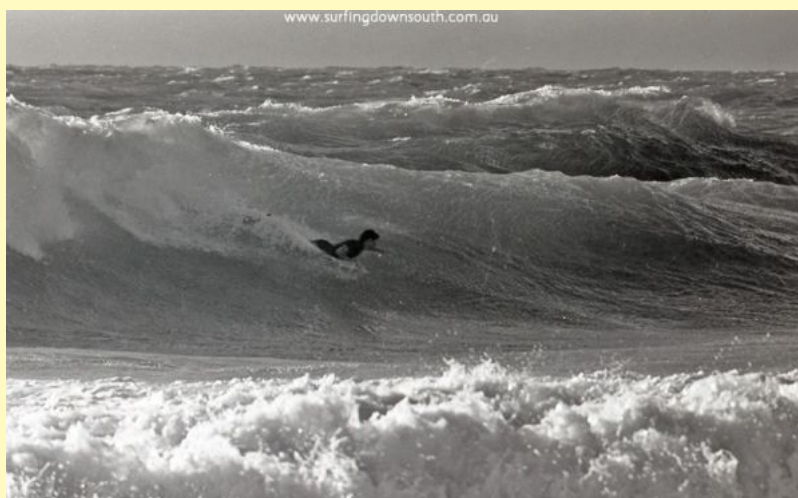
Unknown 1967 at Cottesloe Beach.