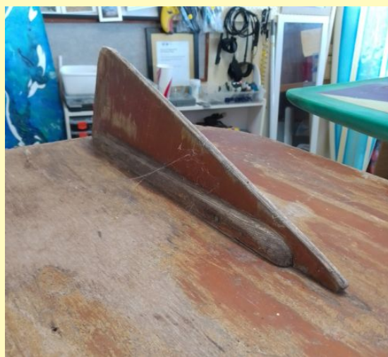
Note the keel fin set up.