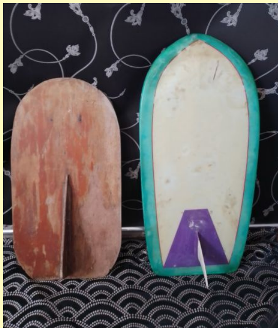
2'10" plywood single fin and 3'4" Innovator belly-board.