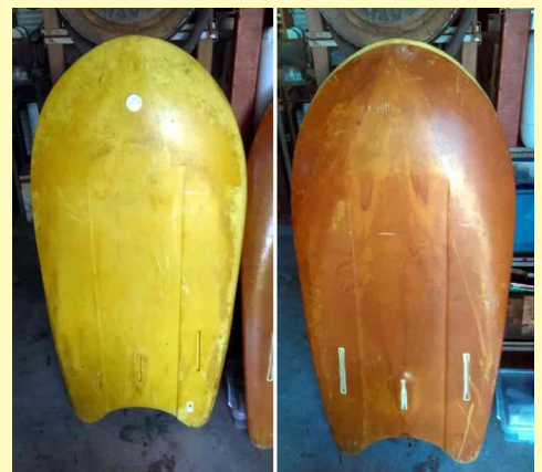
Plywood body boards - bottom