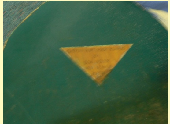
Vidler bellyboard profile.