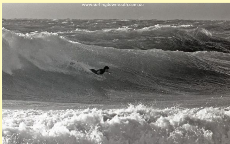
Unknown 1967 at Cottesloe Beach.