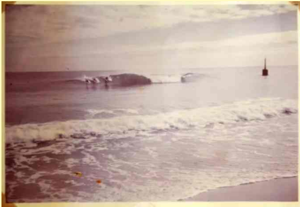
Cottesloe Main break. Artie Shaw and others - 1966.