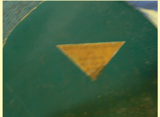
Vidler bellyboard profile.