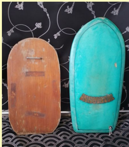
Note drawer handle on the ply board and post production leash plug on the Innovator.