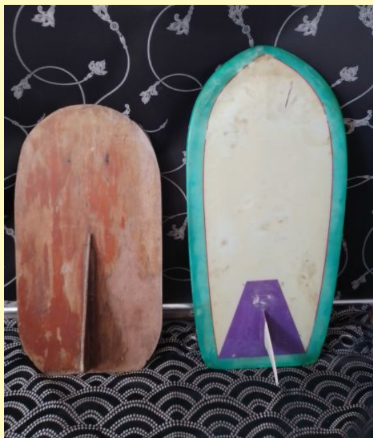
2'10" plywood single fin and 3'4" Innovator belly-board.