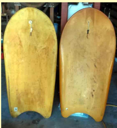
Plywood body boards - deck