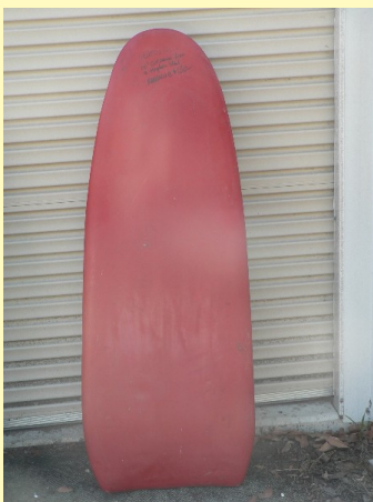
1960s cutdown Hayden mal believed to be from SA.