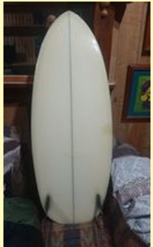
Burford bellyboard: 4' 4 1/4" x 19 1/2" x 2".