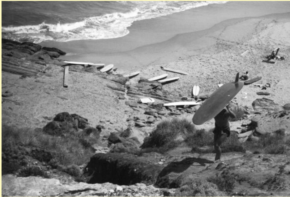
Parsons Beach with bellyboard, early 1960s.