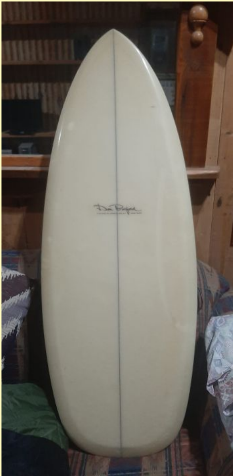
Burford bellyboard: 4' 4 1/4" x 19 1/2" x 2".