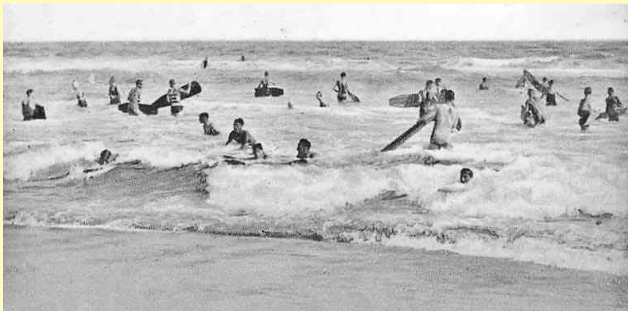
Postcard of Chilton Rocks purchased in 1956.