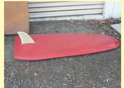
1960s cutdown Hayden mal (4'5.5" x 20") believed to be from SA