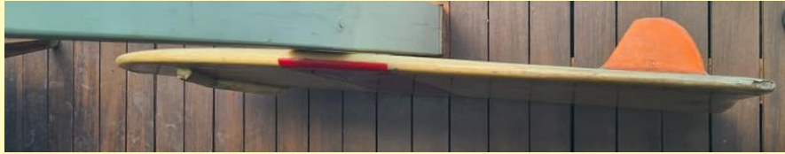
John Arnold twin fin bellyboard.