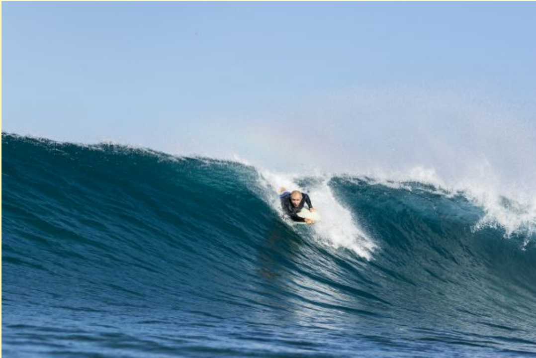
(a) Melauleuca Missile #5.