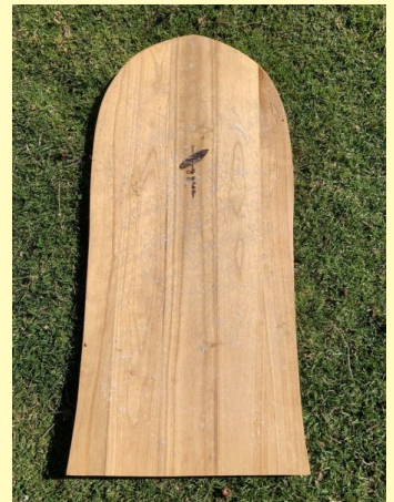
(b) Surfing Green paulownia board.