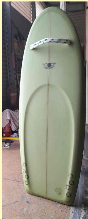
Melaeuca Missile.