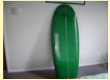
Van Straalen bellyboards