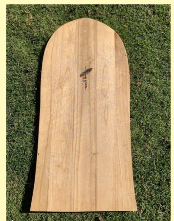
Surfing Green paulownia board.