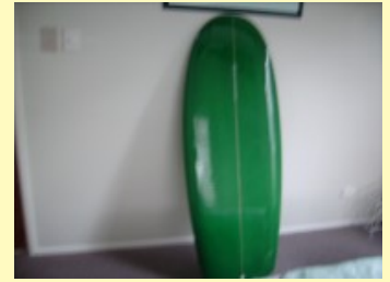
Van Straalen bellyboards