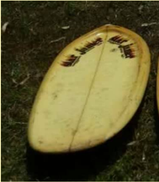
(a) Bellybogger copy