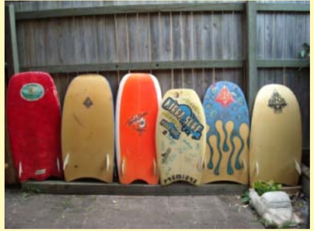
(b) 1980s bellyboards