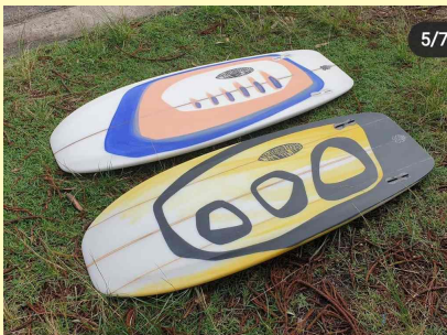
On left: 4'5 1/4" by 20".