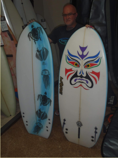
(a) More bellyboards.