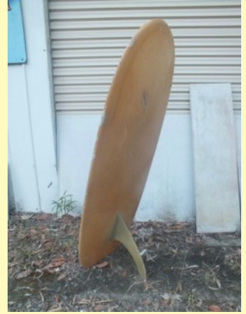
Hohensee belly/kneeboard, shaper Geoff Darby. Unknown board.