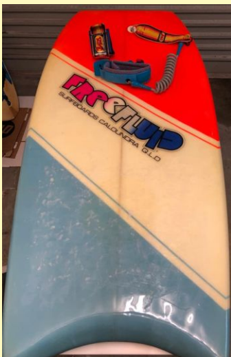
(a) Fluid Foils bellyboard.