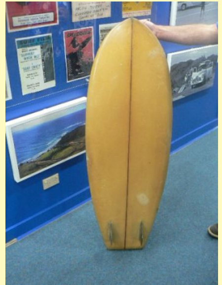
1960s Carey bellyboard. Surfworld Currumbin