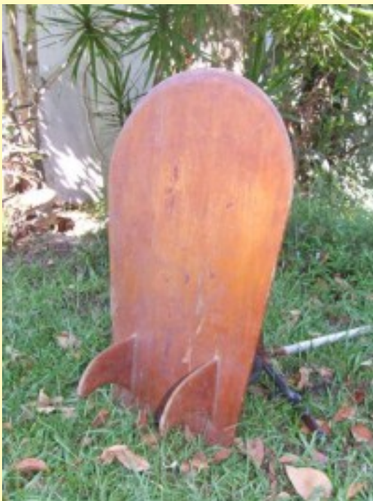
60s ply board - located at a Noosa charity shop.