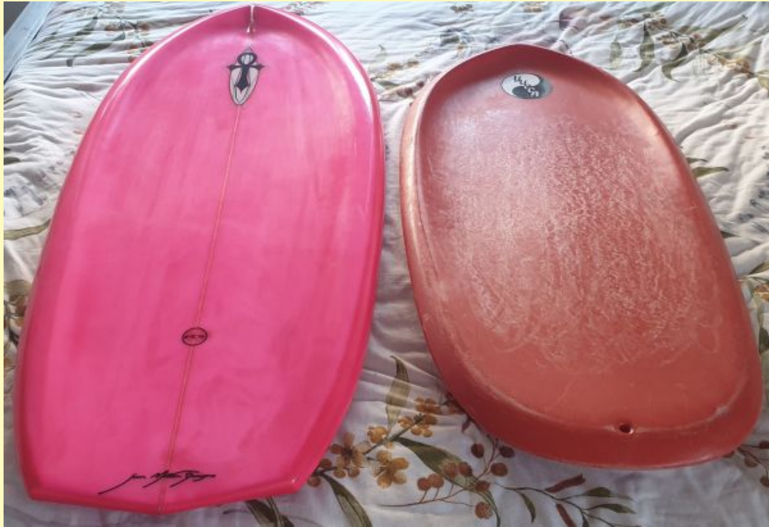
(a) Modern bellybogger shaped by Jim Morton ( instagram.com/metalsurfboards ) and original.