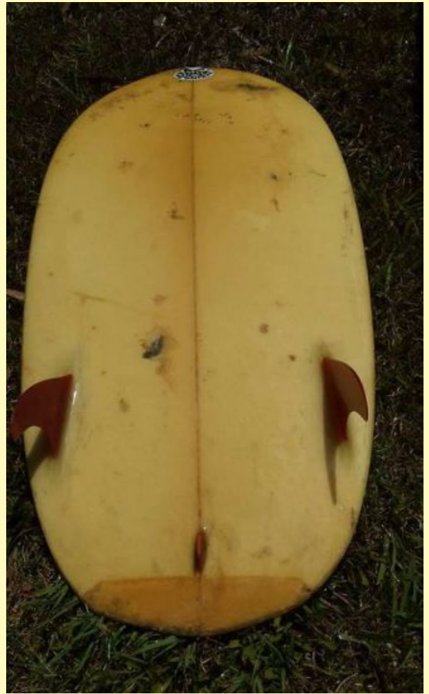
(b) Bellybogger copy.