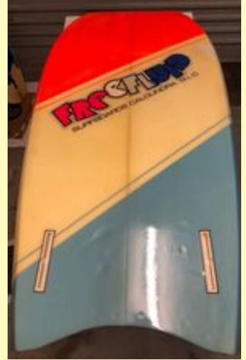
Fluid Foils bellyboard.