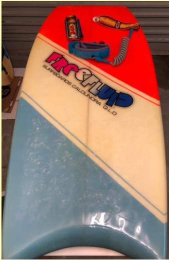
Fluid Foils bellyboard.