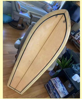
4'5" bellyboard, possibly from Brisbane.