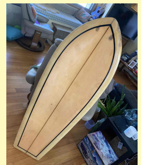
4'5" bellyboard, possibly from Brisbane.