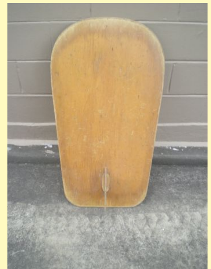
(b) 60s ply board - located at a Noosa charity shop.