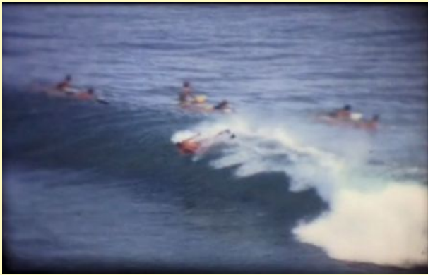
(a) Unidentified c.1973. Kirra