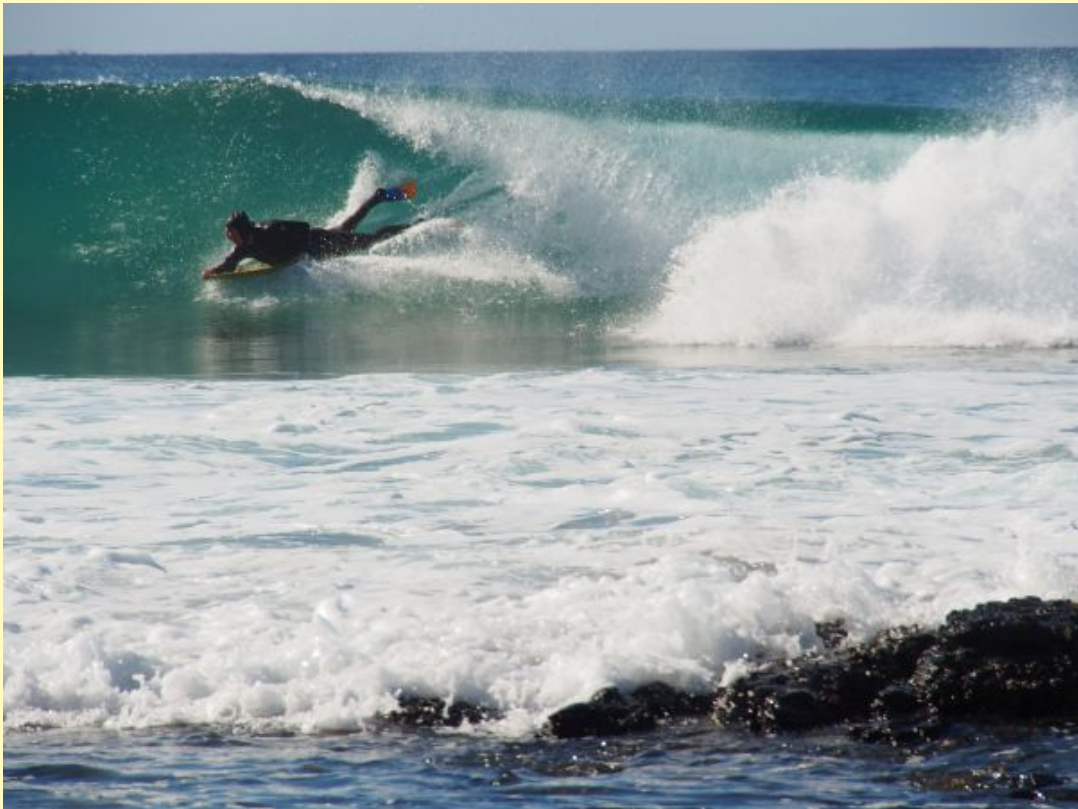
(b) Melauleuca Missile #7.