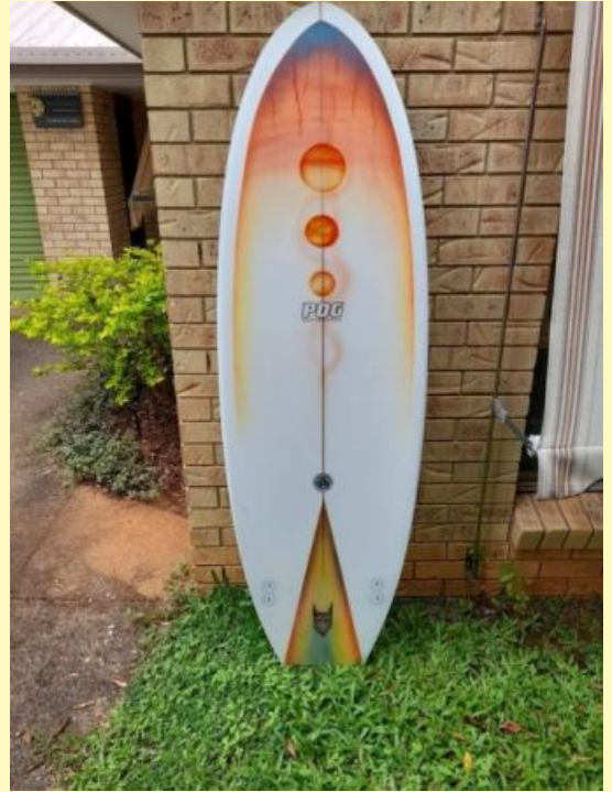
(b) Terry Cooper 6'6" - for bigger days