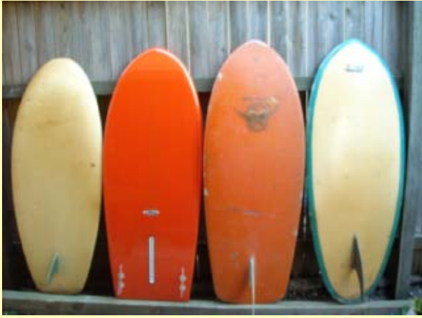
(a) 1970s bellyboards