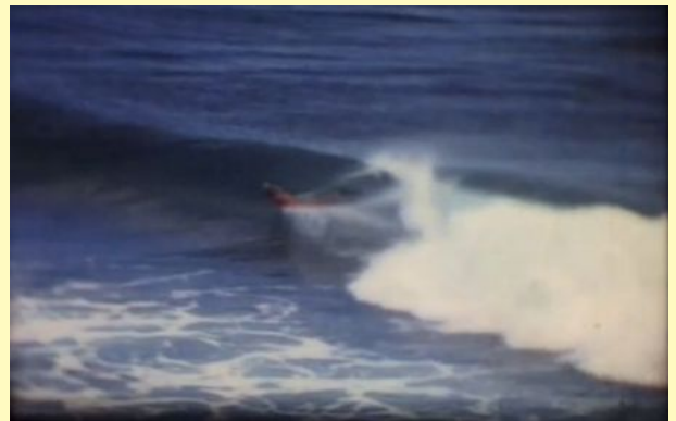
(b) Unidentified c.1973. Kirra.