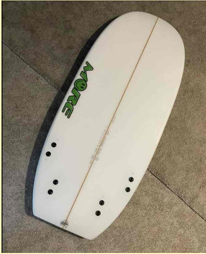
(a) Lesleigh's More bellyboards.