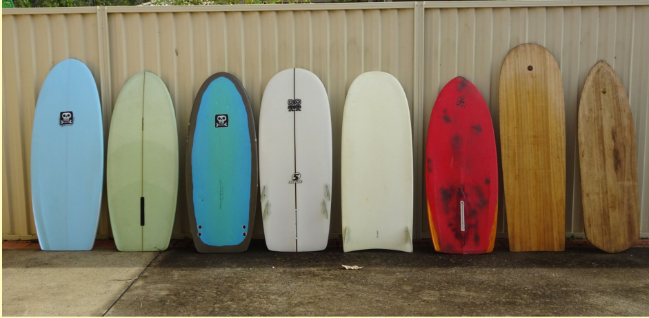
(a) Bob Green bellyboards: finless to 5 fins.