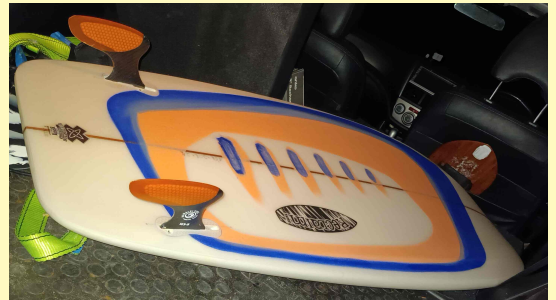
(b) "edge, the massive single to double concave"