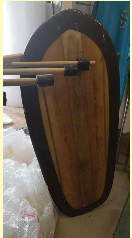
Woosley bellyboards.