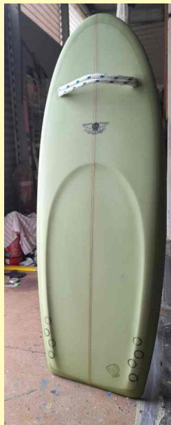
Melaeuca Missile.