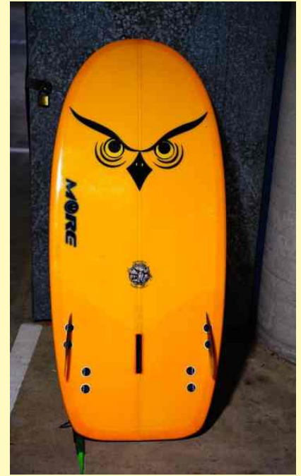
(b) More bellyboard.