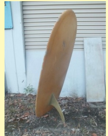
Hohensee belly/kneeboard, shaper Geoff Darby. Unknown board.