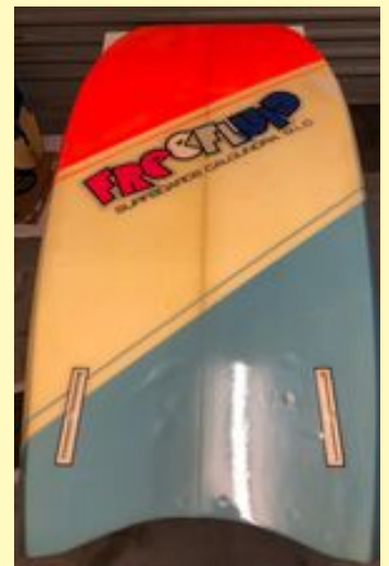
(b) Fluid Foils bellyboard.