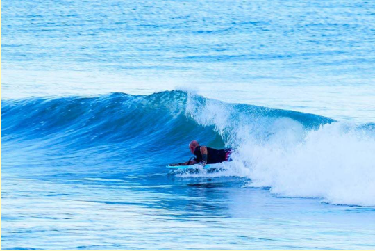
(b) More bellyboard.