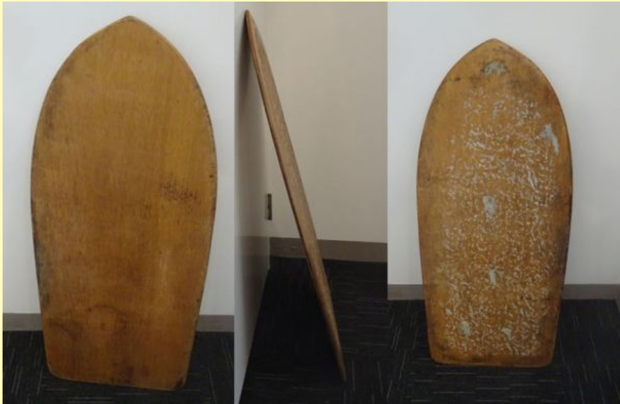
Wooden bellyboard.