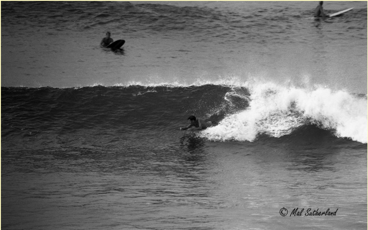
Vinnie Ford? Greenmount.