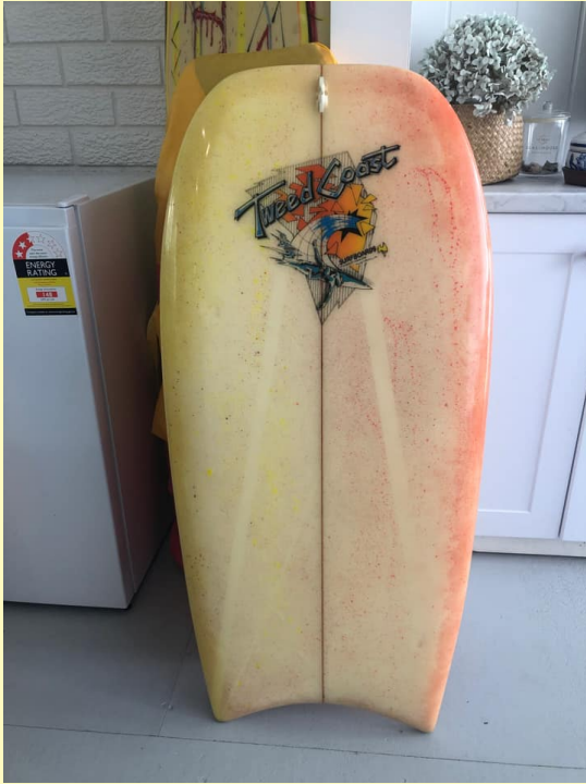
(a) Billy Grant shape.