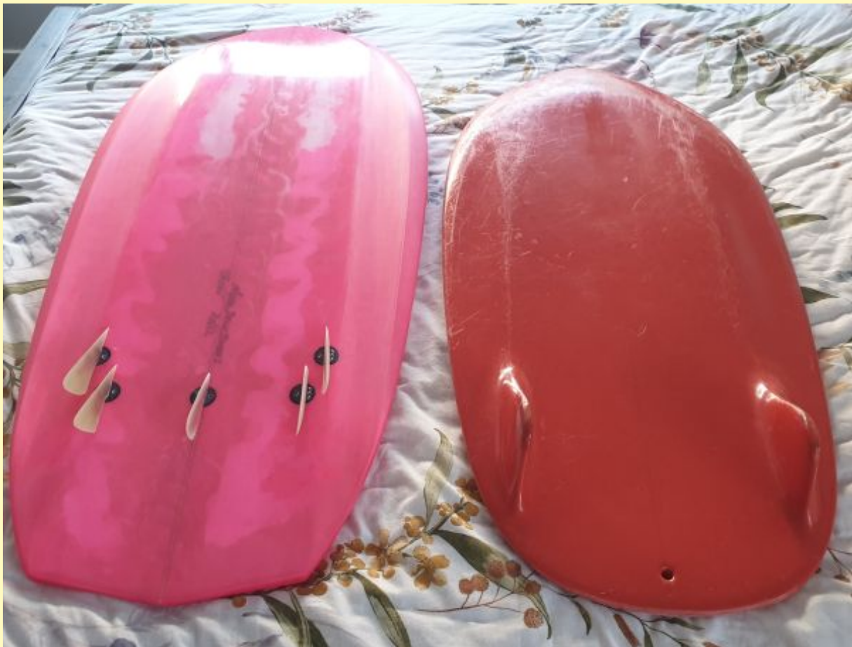
(b) Modern bellybogger shaped by Jim Morton and original.