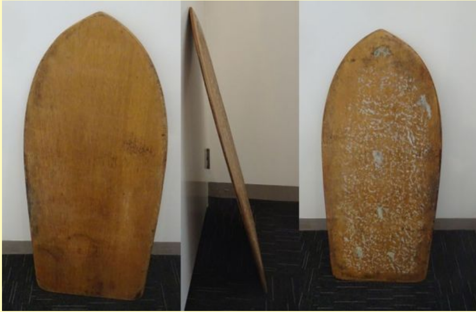
Wooden bellyboard.