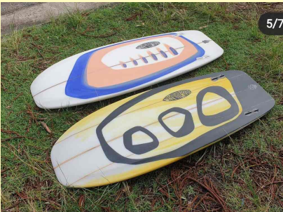
(a) On left: 4'5 1/4" by 20".