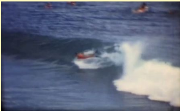
(a) Unidentified c.1973. Kirra

Original footage - Gary Smiley? Craig Halstead edited and posted on former Coastalwatchsite