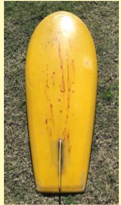
3' bellyboard from Carl Tanner collection.