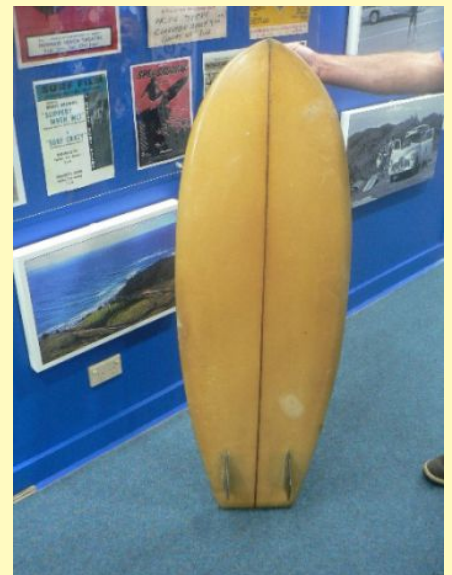
1960s Carey bellyboard. Surfworld Currumbin.