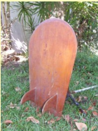
(a) 60s ply board - located at a Noosa charity shop.