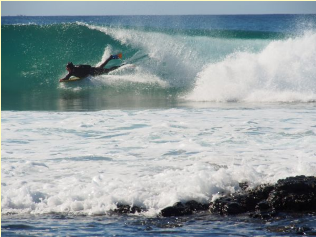
Melauleuca Missile #7.