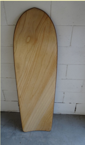
(a) Wegener big wave surfie - with cork deck