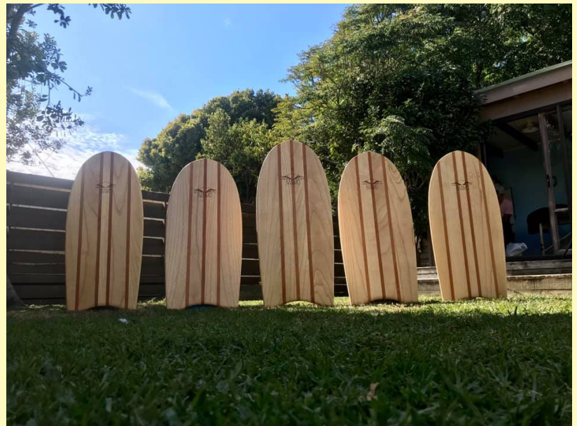
Kerry Hunt paulownia boards, with redwood stringers.