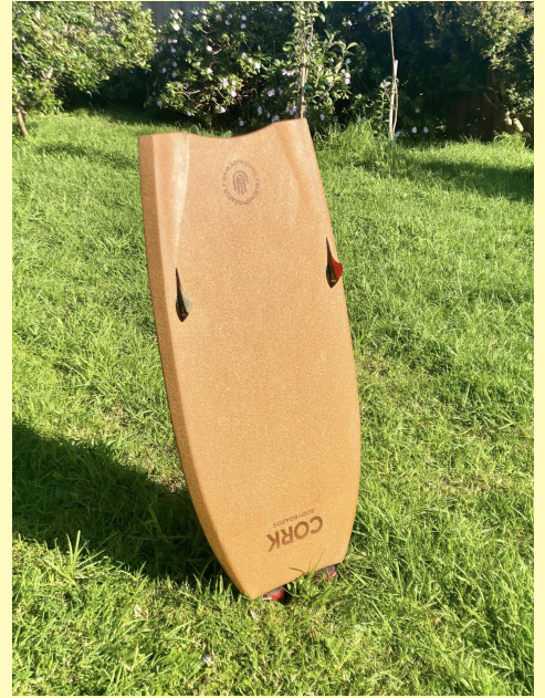
Twin finned board.