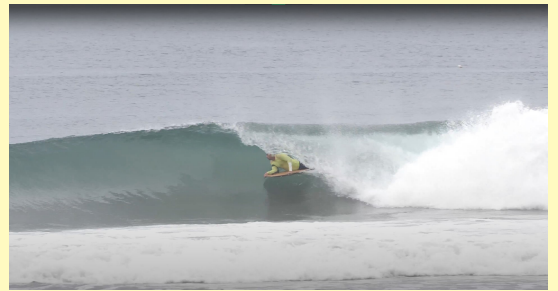
Cork boards in action.