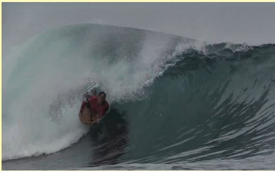
Cork boards in action.