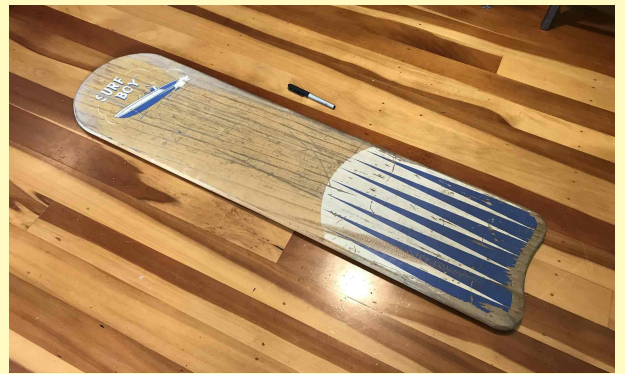
3'6 3/4" x 11 1/2" - Surf Boy bellyboard.