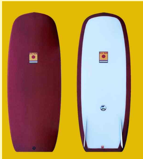
Big Sun paipo. 4'6 x 22' x 2'3/4. Ryan Glover shape. Source: https://www.bigsun.nz/products/big-sun-lord-board .

Ricardo Paes tested a prototype in 2010 and since around 2016-2017 has been creating Cork bodyboards. Now based in New Plymouth, the twin-finned boards are reported to be 65% upcycled styrofoam in the core and 30% cork and 5% paulownia.