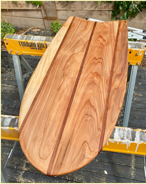
Japanese Cedar with Tasmania Black wood, finish with homemade beeswax polish.

Mamo handplanes have also made some paipo boards.