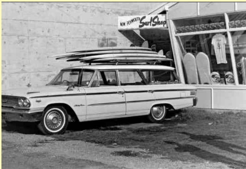
New Plymouth Surf Shop 1963. Bellyboards in the window.