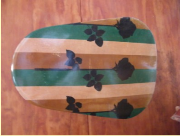
“ Red” Luton’s board.