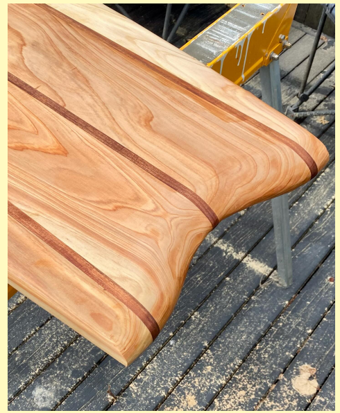
12mm central concave, with 80mm wide 10mm deep chines to the rails.